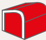
SINGLE SORTING MACHINE